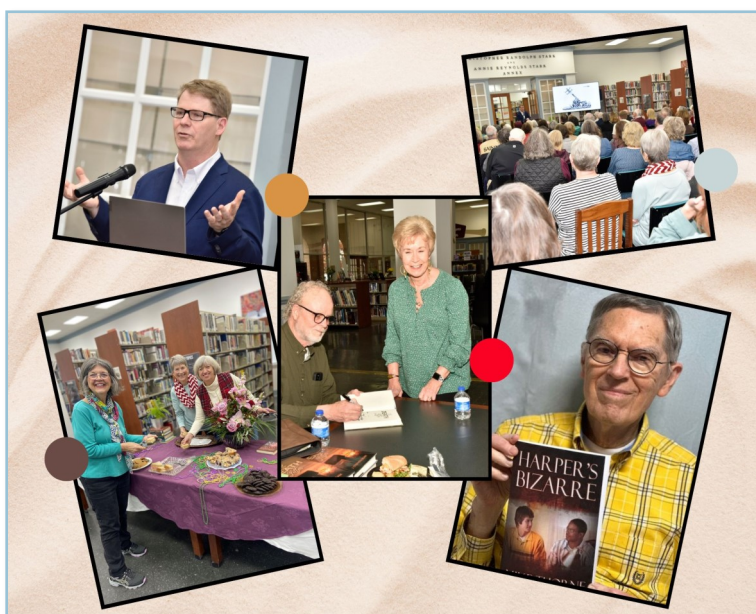
Authors’ discussions, audience interaction, book signings, and social time are all part of Books and Authors the third Thursday of each month.

Mark your calendar for the next season of Books and Authors and join your neighbors. What better way to spend an hour at the library than in sociable company with entertaining authors and delicious snacks.