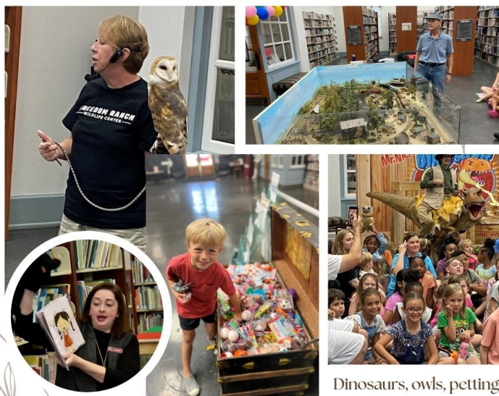
Dinosaurs, owls, petting zoo, trains, treasure box and more!