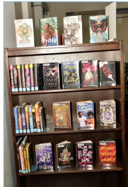
Display of amazing teen books at our library

To celebrate the successful Summer Teen Reading Program, an exclusive teen lock-in was planned for August 9. It was a great ending to the 2024 Teen Reading Program.